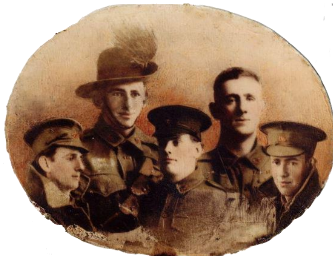
Portrait of the 5 brothers that their mother used to wear