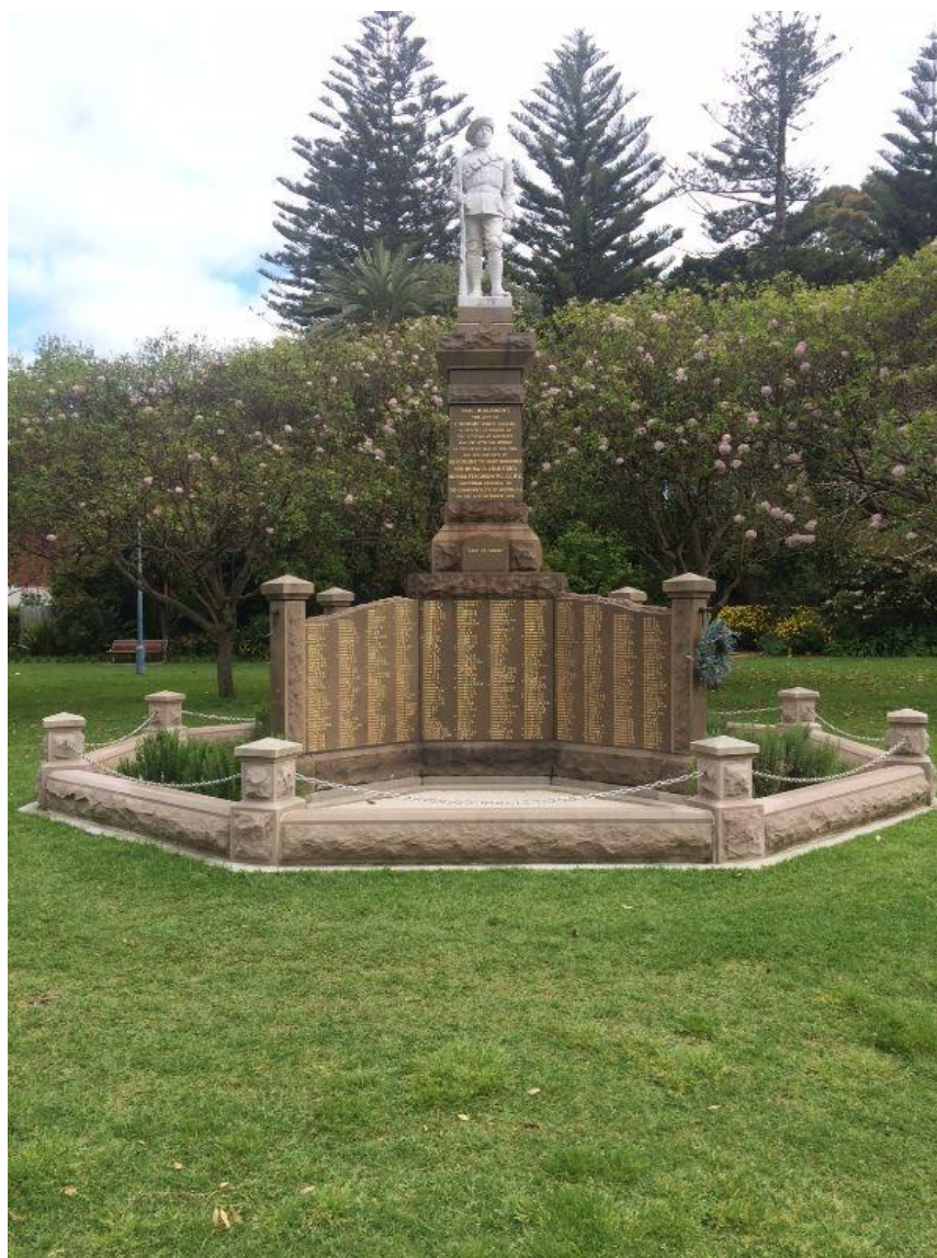
Waverley Soldier's Memorial