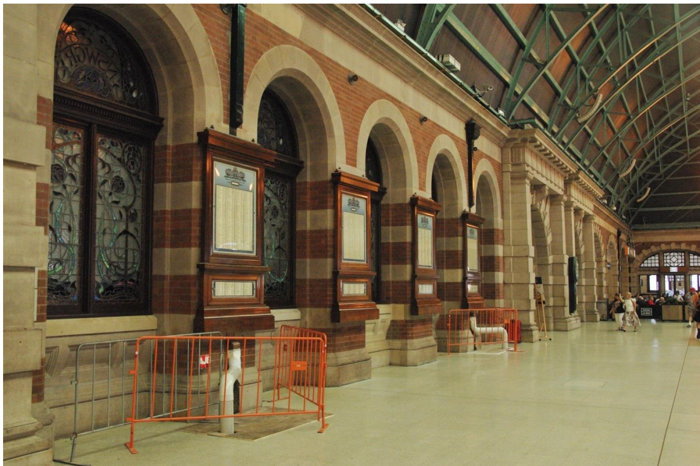
NSW Government Railways & Tramways Roll of Honour